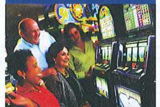
Give Lady Luck a Spin!