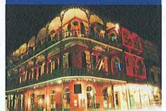
Free Time in FRENCH QUARTER OF NEW ORLEANS

Departure: Roswell Adult Center, 830 Grimes Bridge Rd, Roswell, GA @ 8 am, then Alpharetta Adult Activity Center, 13450 Cogburn Rd, Alpharetta, GA @ 8:30 am