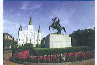
Guided Tour of NEW ORLEANS